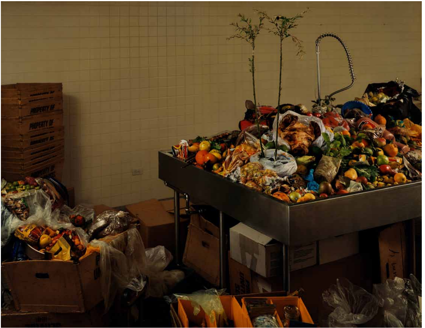
U.S. Customs and Border Protection, Contraband Room John F. Kennedy International Airport Queens, New York

African cane rats infested with maggots, African yams (dioscorea), Andean potatoes, Bangladeshi cucurbit plants, bush meat, cherimoya fruit, curry leaves (murraya), dried orange peels, fresh eggs, giant African snail, impala skull cap, jackfruit seeds, June plum, kola nuts, mango, okra, passion fruit, pig nose, pig mouths, pork, raw poultry (chicken), South American pig head, South American tree tomatoes, South Asian lime infected with citrus canker, sugar cane (poaceae), uncooked meats, unidentified sub tropical plant in soil.