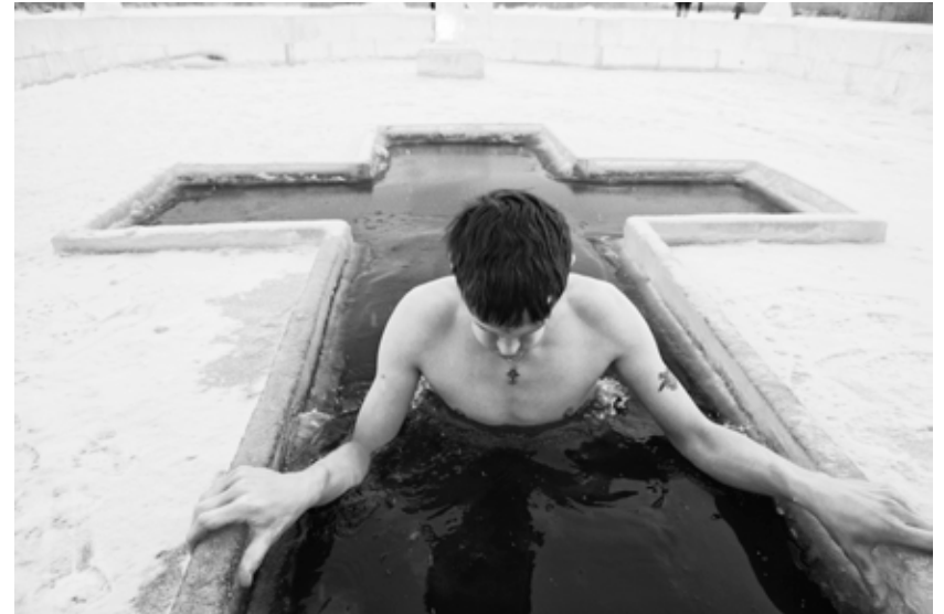
Festival of the Epiphany, Russia 2010