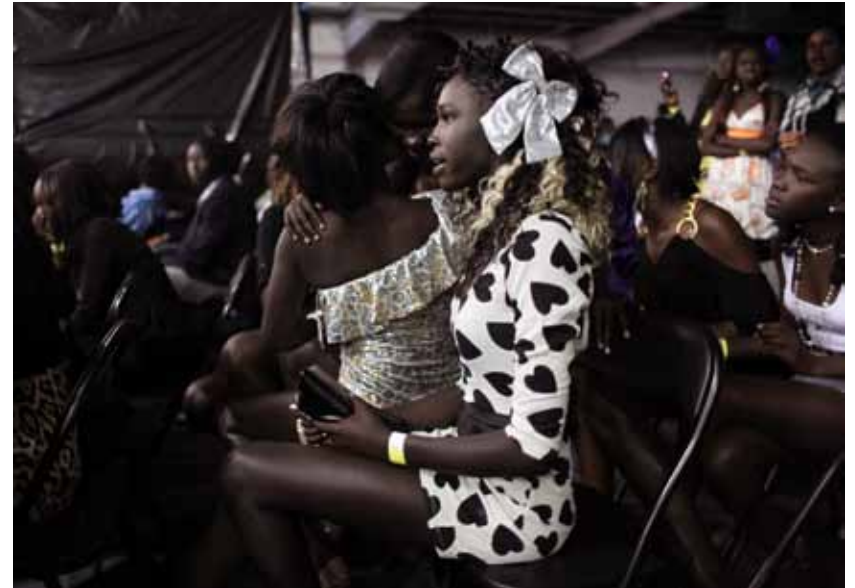
A young woman dressed up for the event 2010