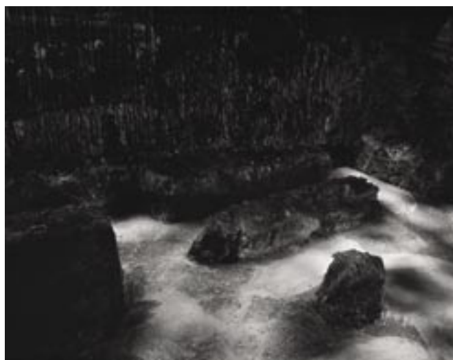
Andrew Curtis Toorak Road 6 2002, selenium toned silver gelatin print, 120x150cm

Catalogue Underpin , text by Greg Neville, 26.5 x 21 cm catalogue, black and white reproductions, 6 pp.