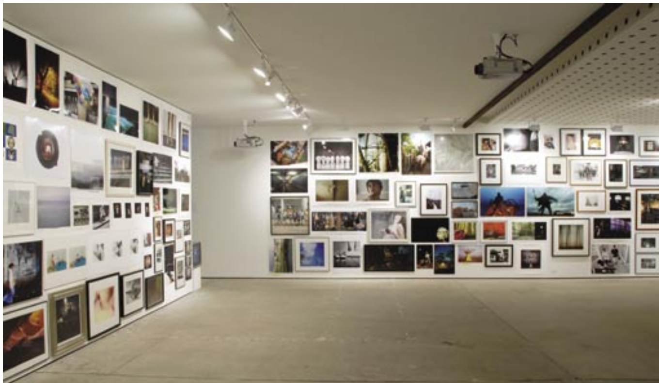
2006 Kodak Salon, installation view