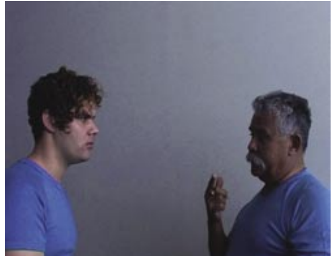
Christian Thompson Father You Know I'm Not So Free 2006, DVD, sound, 2:30mins (video still) Courtesy the artist and Gabrielle Pizzi Gallery, Melbourne

61 in magazines and art journals, 20 in local/street press and organisational newsletters, 35 in electronic media, 16 on radio and 2 on television.