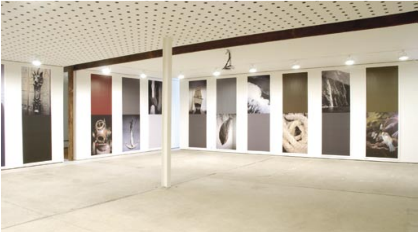
Gavin Hipkins, The Village 2002–06, inkjet vinyl prints, 300x105cm each, installation view.