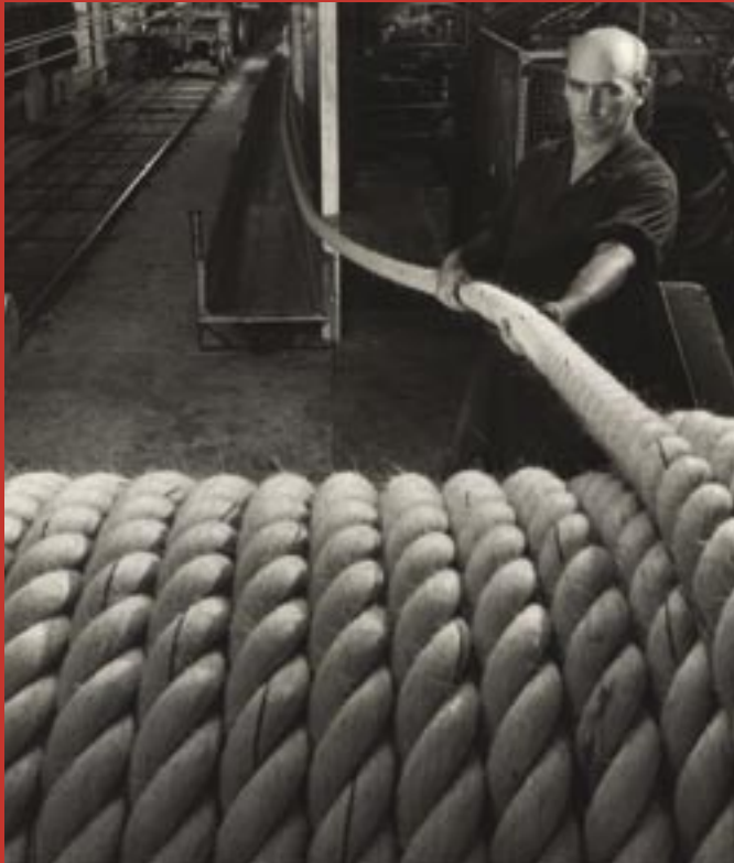
Wolfgang Sievers Ropemaking, Miller Rope, Melbourne 1962 (printed 1972), gelatin silver photograph, 60.7x50.5cm, National Gallery of Victoria, Melbourne. Purchased through the Victorian Arts Board, 1972.