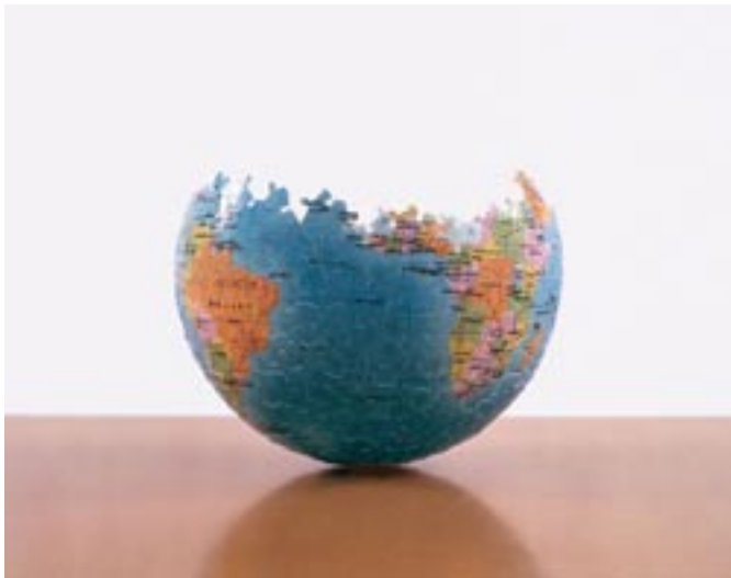
Debra Phillips Globe Puzzle 2004, giclee print, 80x100cm