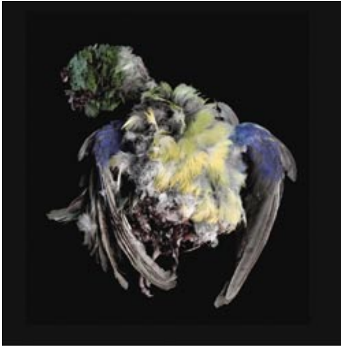
Julie Davies twenty second of september two thousand five 2002–05, inkjet print, 50x60cm (detail)