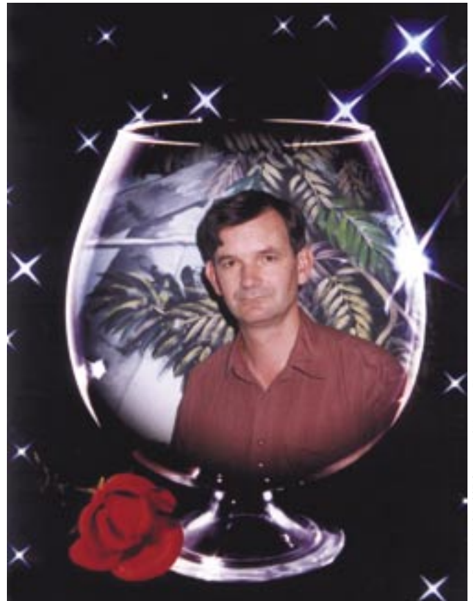
Martin Parr. JAMAICA 1997.