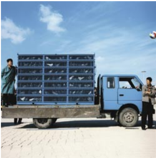
Selina Ou Caged Pigeons, detail 2003