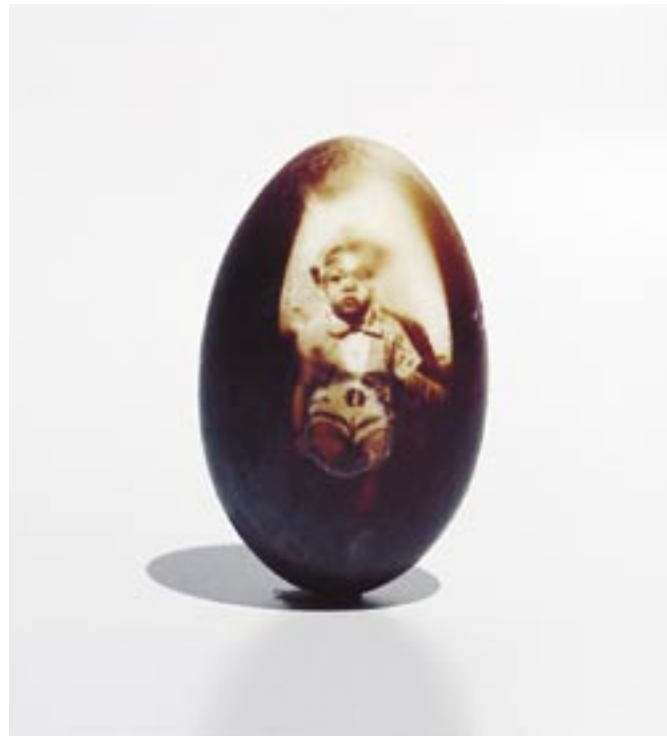
Aaron Seeto One thousand other things , detail 2001