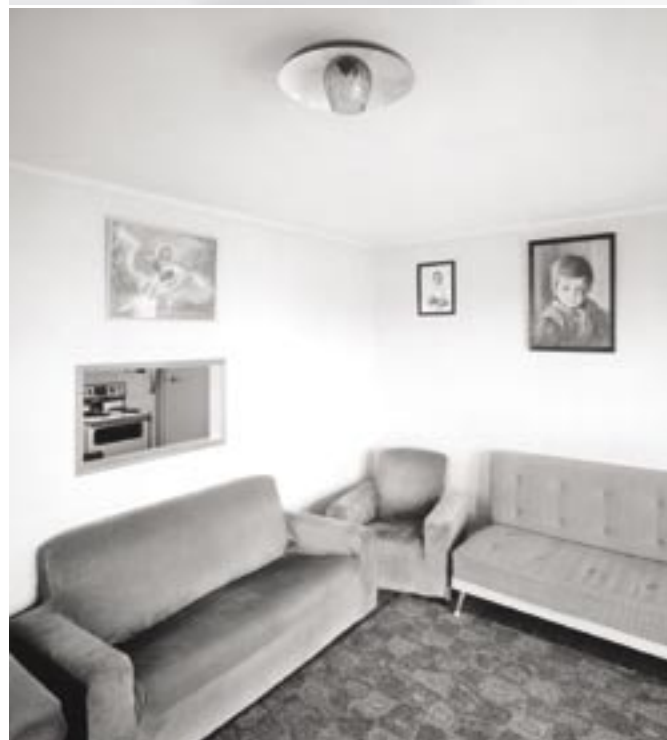
Laurence Aberhart Woods' Interior, Russell , detail 1985